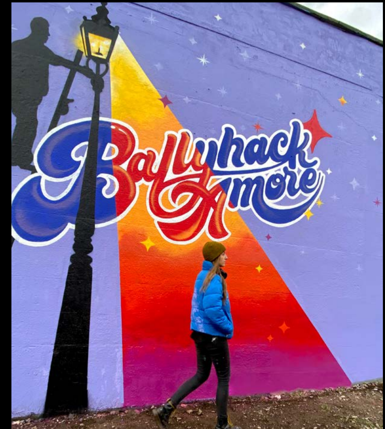
02 BALLYHACKAMORE MURAL Full size gable end wall mural commissioned by Belfast Council.